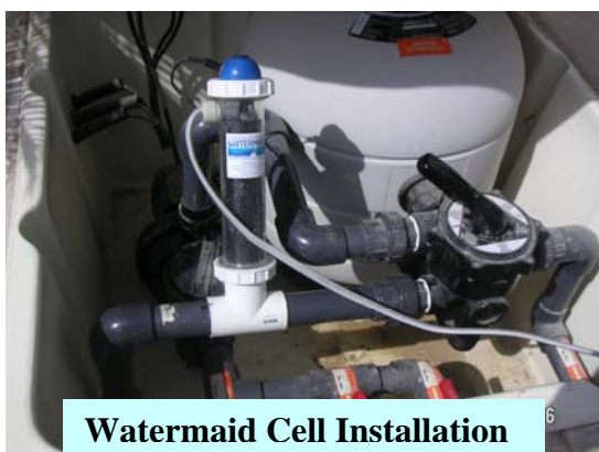
Watermaid Cell Installation